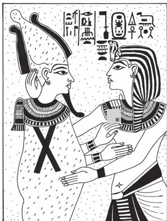
Mural in King Tut's tomb showing King Tut with Osiris, the god of the afterlife

Back in the trailer a technician pulled up astonishing images of Tut on a computer screen. A grey head took shape from a scattering of pixels, and the technician spun and tilted it in every direction. Neck vertebrae appeared as clearly as in an anatomy class. Other images revealed a hand, several views of the rib cage, and a transection of the skull. But for now the pressure was off. Sitting back in his chair, Zahi Hawass smiled, visibly relieved that nothing had gone seriously wrong. "I didn't sleep last night, not for a second," he said. "I was so worried. But now I think I will go and sleep."